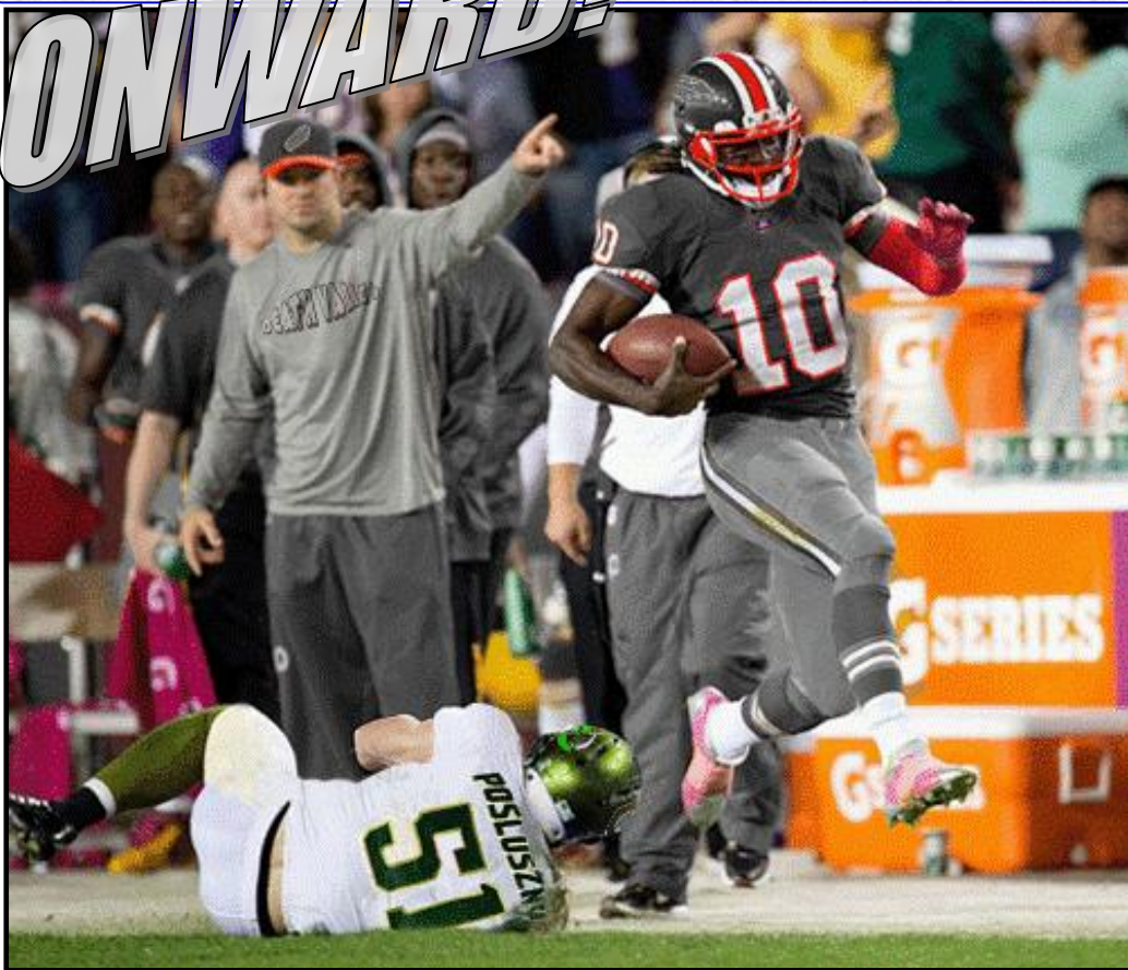
Robert Griffin III skirts past a diving Paul Posluszny on his way to a 24-yard run in 3 rd quarter action at the Graveyard. In a strange and thrilling game full of ups and downs for both teams, the Undertakers slipped past the Violators 36-34.