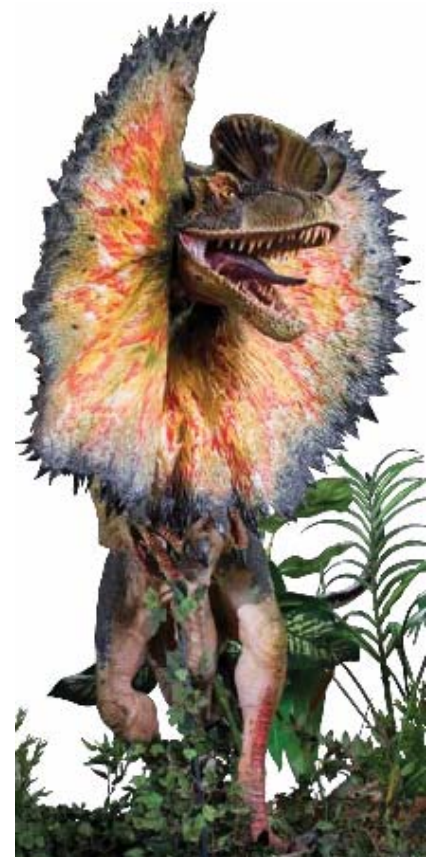
The Celinosaurus. Celine Dion's personal pet and Durham mascot.

The grounds-keepers work seven days a week, sixteen hours a day, and are more familiar than anyone with the strange growing conditions in Jurassic Park. "We use a seed called 'Mezanoic Mat' that grows about an inch every twelve hours. The blades are flat and 4 inches wide. I don't know where they get the stuff but we go through about twenty lawnmower blades a week cutting it," says another grounds-keeper, named Bill. "It makes a nice stadium turf though."