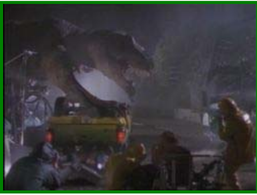
Tailgating outside the stadium can be dangerous at Durham's Jurassic Park.

team's buses and entourage. West and North are for regular fans attending the game. The South lot is for young families too cautious to brave the stadium and the jungle. It contains a small and well-protected theme park with rides, restaurants, and a petting zoo enclosed behind a wall of gigantic trees and electric fencing to keep the "beasts" out. "Beasts" is a euphemistic term used by the staff at Jurassic Park to refer to the dinosaurs. Yes, dinosaurs. Not real ones, at least not the originals, but genetically engineered dinosaurs recreated by fragments of DNA recovered from archeological digs in the tar sands of Northern Alberta.