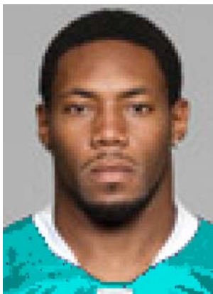
Antonio Cromartie is tearing up camp at a Pro Bowl pace. Get used to reading about him.