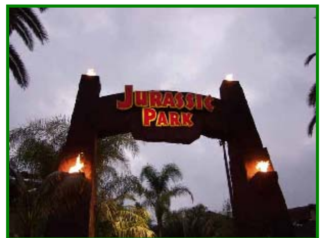
Entrance to Jurassic Park, home of the Durham Thunder Lizards.

The road suddenly opens up and branches out in four different paths leading to the East, West, North and South parking lot areas around the stadium. East is reserved for tour groups and the