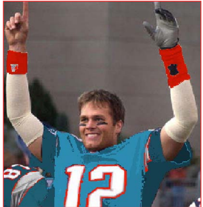
Florida quarterback, Tom Brady. Will he tire out his arms celebrating in 2008?