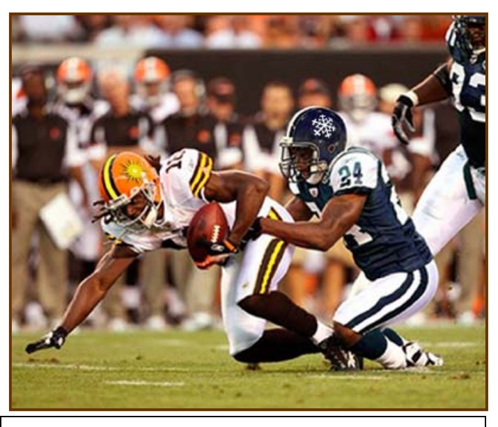
Markham's Donte Stallworth lunges forward for a first down as Colorado's Domonique Foxworth tries to pull him back. Stallworth caught 7 passes, all for first downs, as the North Stars clobbered the Thundersnow, 24-0 in Week Five action.