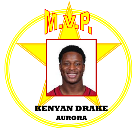
KENYAN DRAKE AURORA

21 carries, 120 yards, 9 1 st downs. Explosive running led to key 1 st half TD.